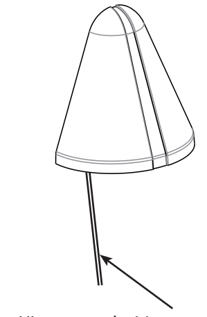
Use UL approved wiring connectors for SPT-1 cord

The DECK series permits operation only at 12 VAC. Wire fixture using UL approved wire connectors (ordered separately) for SPT-1 cord.