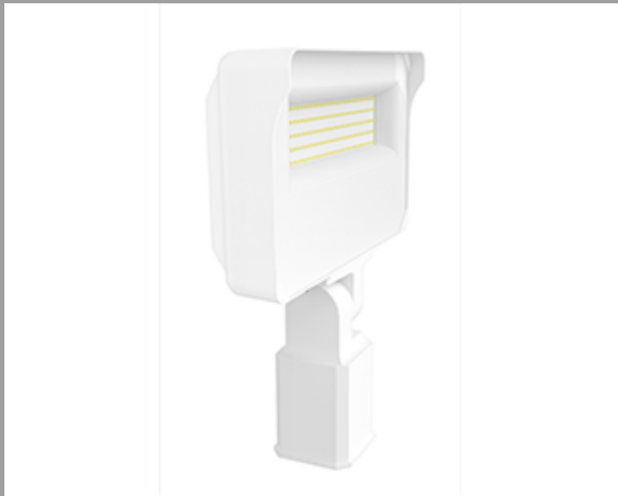
General purpose lighting that's pocket friendly. Color: White Weight: 7.3 lbs