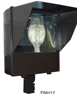
FNH12 Hood shown