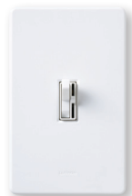
Ariadni® C•L Gloss colors (excluding gray)