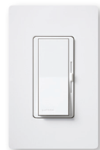
Diva® C•L Gloss and Satin Colors