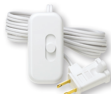
Credenza® C•L Black (BL), White (WH), & Brown (BR)