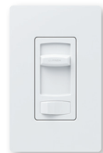
Skylark Contour® C•L Gloss colors