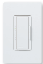
Maestro® C•L Gloss and Satin Colors®

Available in a variety of aesthetic styles and colors to match any décor