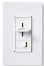
Skylark® C•L Gloss colors (coming soon)