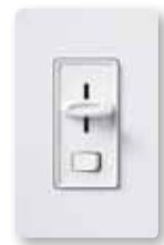
Skylark® C•L Gloss colors (coming soon)