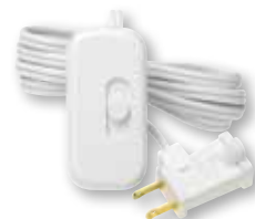
Credenza® C•L Black (BL), White (WH), & Brown (BR)