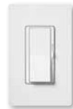
Diva® C•L Gloss and Satin Colors