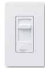
Skylark Contour® C•L Gloss colors