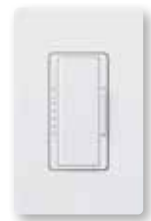
Maestro® C•L Gloss and Satin Colors®

Available in a variety of aesthetic styles and colors to match any décor