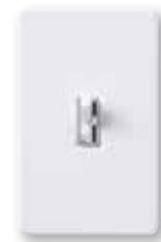
Ariadni® C•L Gloss colors (excluding gray)