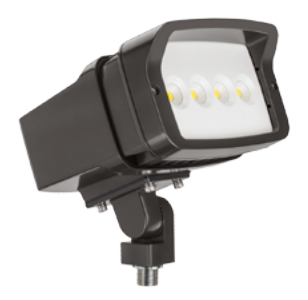
THK- Knuckle with 1/2" NPS threaded pipe