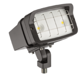
Wire Guard OFL1WG