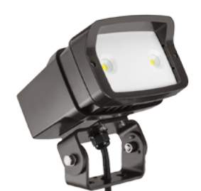
YK- Yoke mount