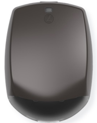
with photocell (dark bronze)