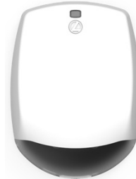
with photocell (white)