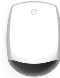
without photocell (white)