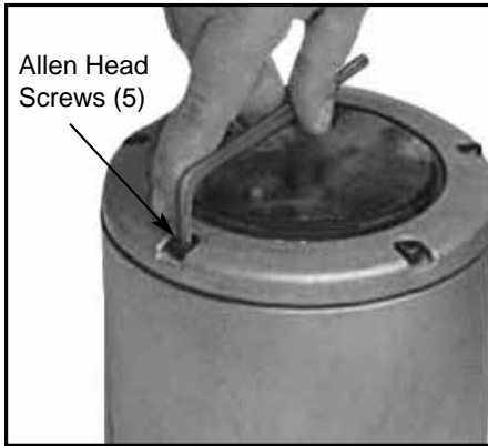
3. To open fixture, remove five (5) allen head cap screws, lens frame, lens and gasket.