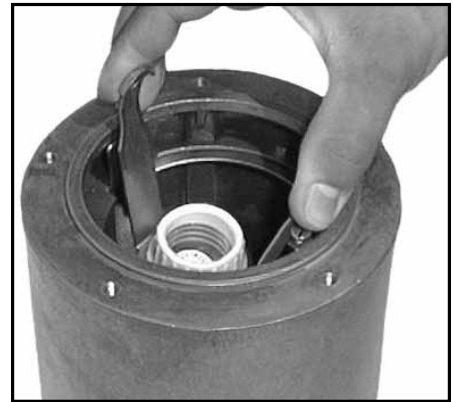
5. Gently compress legs of socket bracket inward and remove socket bracket assembly.