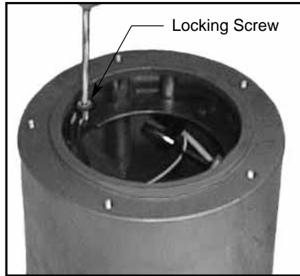
4. Loosen vertical locking screw. (Do Not Remove)