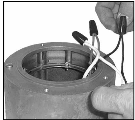
8. Make wire connections observing polarity, i.e., green-to-ground, white-to-common, and black-to-voltage. Replace splice compartment cover and tighten to 15 inch/pounds (1¼ ft. lbs.).