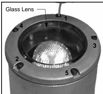
10. Make sure housing flange is clean and free of all dirt and debris. Replace lens, gasket and lens ring. Secure with allen head cap screws (5). Tighten opposing screws progressively and evenly to 20 inch/pounds, (1.67 ft. lbs.).