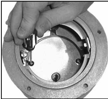
6. Remove two screws securing splice compartment cover in place and remove cover.