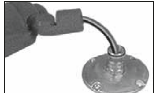
Step 3 - Install fixture onto coupling. Attach fixture leads observing polar-ity, i.e., braided bare copper wire-to-ground, white-to-common, and black-to-voltage.

*Consult KIM Landscape Catalog for mounting device options.