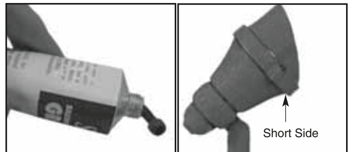
Step 5 - Coat shield screw threads with silicone grease. Install shield and lens with short side down to drain water and tighten screws progressively.