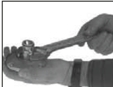
Step 2 - Tighten coupling onto mounting device*.

*Consult KIM Landscape Catalog for mounting device options.