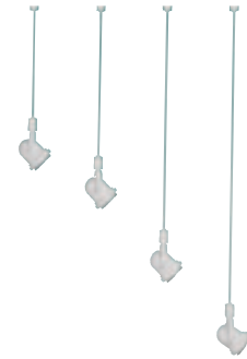
† Wand with slope adapter on top. For Biax Series, consult factory.