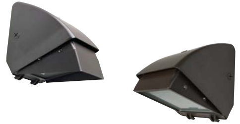
Compact Unit with Shield Removed in Field