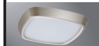
6255SN Satin Nickel