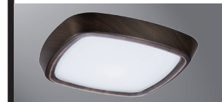
6255TBZ Tuscan Bronze