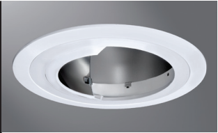
424P Open Wall Wash & Downlight, White Trim

Compatible with Halogen, Incandescent, LED* or CFL* lamps.