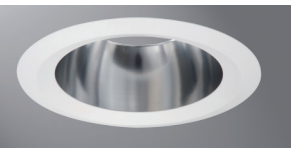
6107SC Specular Reflector, White Trim

*UL1993 listed LED & CFL equivalent lamps permitted. Consult lamp manufacturer for conditions of use. Eaton does not warranty the lamp.