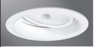
478P White Splay, White Trim

Compatible with Halogen, Incandescent, LED* or CFL* lamps.