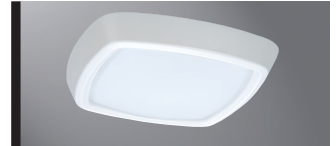
5255WH White Plastic Trim, Frost Glass Lens with Reflector

*UL1993 listed LED & CFL equivalent lamps permitted. Consult lamp manufacturer for conditions of use. Eaton does not warranty the lamp.