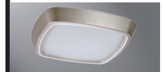
5255SN Satin Nickel Plastic Trim, Frost Glass Lens with Reflector