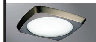
5230TBZ Tuscan Bronze Squircle Trim, Frost Glass Lens