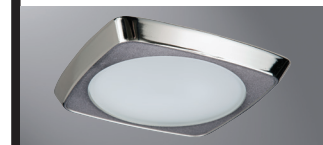
5230PN Polished Nickel Squircle Trim, Frost Glass Lens