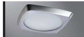
5230AH Aluminum Haze Squircle Trim, Frost Glass Lens

*UL1993 listed LED & CFL equivalent lamps permitted. Consult lamp manufacturer for conditions of use. Eaton does not warranty the lamp.