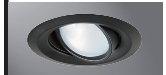
5165BK Black Gimbal, Black Trim