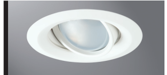
5165WH White Gimbal, White Trim

Compatible with Halogen, Incandescent, LED* or CFL* lamps.