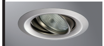
5165SN Satin Nickel Gimbal, Satin Nickel Trim