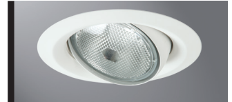
5130WH White Eyeball, White Trim