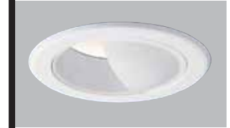
5030W White with White Baffle