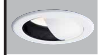
5030P White with Black Baffle