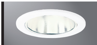
4003SC Specular Reflector, White Trim

Compatible with Halogen, Incandescent, LED* or CFL* lamps.