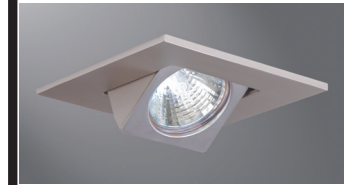
3013SN Satin Nickel