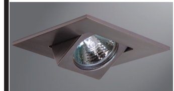
3013TBZ Tuscan Bronze