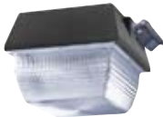
SmartVAN3 with Mini Sensor Add suffix /MS CFL 120 volt only