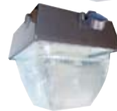
SmartVAN5 with Mini Sensor Add suffix /MS CFL 120 volt only