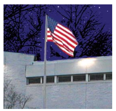
RAB weatherproof floodlights are a favorite choice for lighting flags and monuments because of their low cost and classic good looks that last. See page 128 for flag lighting info.

Fully adjustable swivel with sure-grip locks