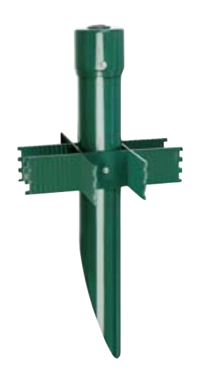
Finish: Black White Verde Green

17" PVC mounting post for lighter weight ground mounted landscape lighting. Post is 2" pipe (2 3/8" O.D.) for cleaner look. In-ground stabilizing arid included.