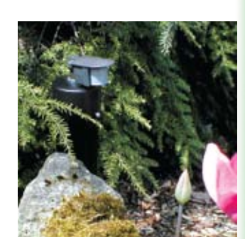
A convenient mounting for landscape lighting sensors. See page 38.