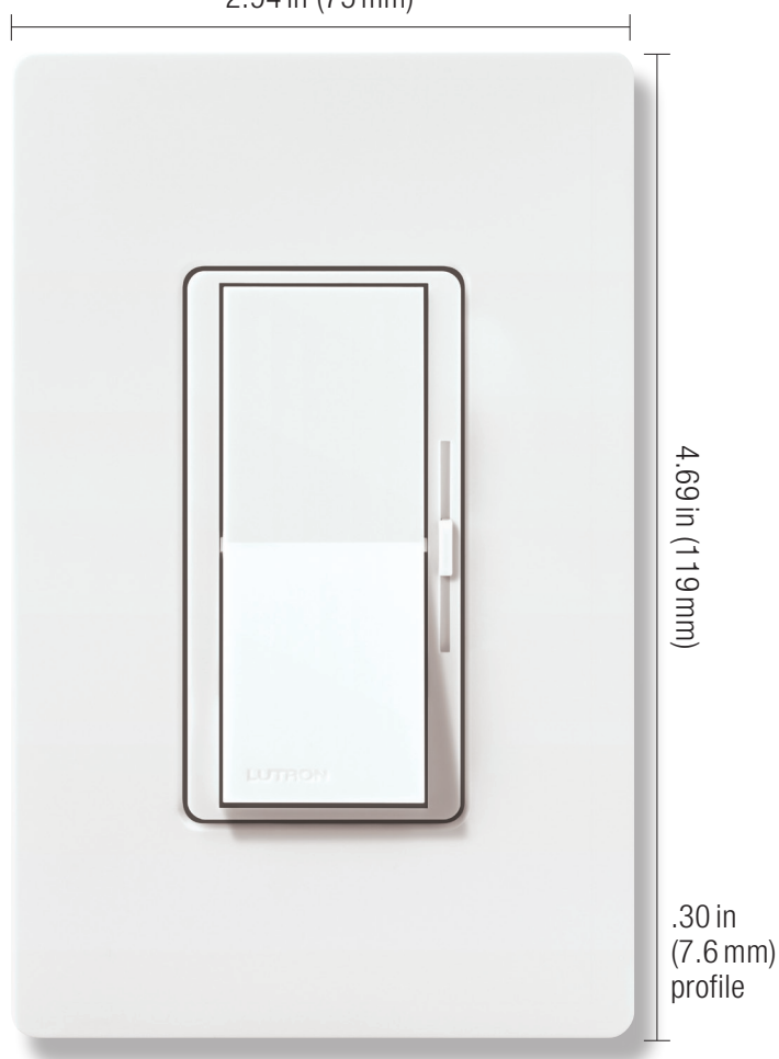
Shown actual size: Diva preset dimmer and 1-gang Claro wallplate in White (WH).