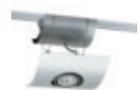
Shown with Airfoil Trim Accessory (Order Separately)